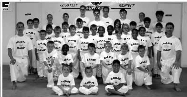
AFTER KARATE CAMP

Special Price $250 FAMILY DISCOUNT: $200.00 EACH (1 or more registrations from the same family)