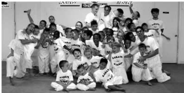
BEFORE KARATE CAMP